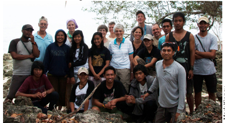
The Painters: AITo staff and visitors, only two of them professionals, suddenly all became artists, discovering pleasures and talents many of them didn’t know they possessed.