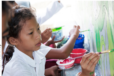
Teku schoolkids took a good look at their native vegetation, then painted it.

for eco-tourism. An official from the government tourism ministry who came to view the works in progress remarked, “These murals are so beautiful, people will come not only for the nature, but just to see the paintings!”