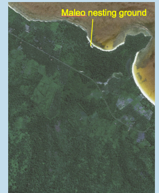
Landscape surrounding maleo nesting ground. AITo hopes to protect more of the natural forest in lower half of photo.

That's why AITo has recently begun an effort to expand the protected corridor around the maleo nesting ground near Taima village. Working with local landowners and government, in the months to come AITo hopes to expand protection of the area