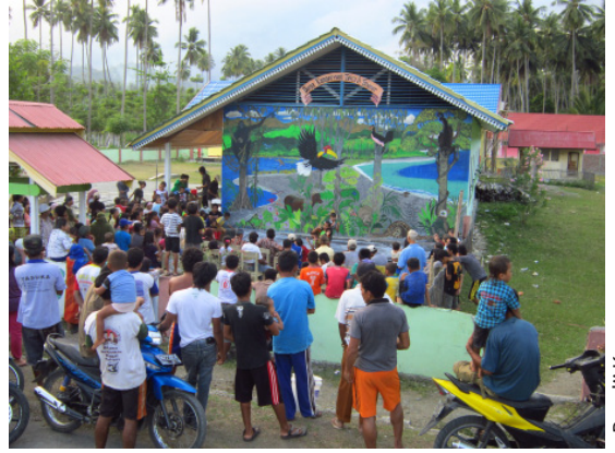
A community effort: the unveiling ceremony for Teku/Toweer’s new mural draws a crowd.

When the murals were complete, each village had an unveiling ceremony, in which the big plastic tarps — which had shielded the painters from the sun all week, and then served as curtains — were dropped. There were dignitaries, speeches and refreshments. In Taima village, an official from the district government spoke of her gratitude that Taima was protecting the maleo and other wildlife, and how this mural would give their village an added attraction. In Teku, a group of children offered a celebratory dance performance. A speech offered by one young girl closed the event: “On behalf of the primary school of Teku/Toweer village, we’d like to thank AITo for making our school so beautiful.”