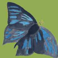
Wista Lamato, 17

info@tompotika.org or tompotika@centurytel.net www.tompotika.org