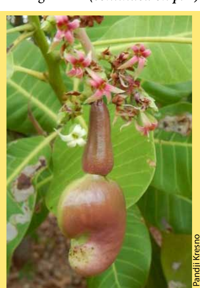
Who'll stop the rain? Cashew trees need a minimum interval of rain-free days in order to flower and produce fruit. Those intervals are growing rare in Tompotika, and so are cashews.

Here is what used to be "normal" for Tompotika: about 2500-3000 mm (100-120") of rain per year, with some of that falling every month of the year, but with 7-9 "wet" months (rain nearly every day) and 3-5 "dry" months (often several days between rains). Overall, a lot of rain--this is, after all, the home of tropical rainforests!--but in a pattern to which plants, animals, and people were adapted. In (continued on p. 3)