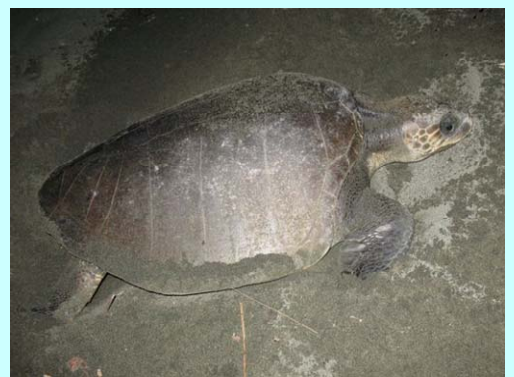
An Olive Ridley female digs her nest pit on Teku beach.

and Taima, virtually every detected sea turtle adult and nest was poached. Now, however, not only are turtles and nests being protected, but in their nightly beach patrols AITo staff have discovered an additional sea turtle species not previously known to nest in the area: the Olive Ridley turtle ( Lepidochelys olivacea ) . The Olive Ridley, along with Green, Hawksbill, and Leatherback turtles, makes Tompotika one of only a handful of places in the world in which four of the world's seven sea turtle species are documented to nest . AITo is now gearing up for the 2009 sea turtle season (roughly March–August), in which we hope to expand our sea turtle patrols and initiate several new protection strategies.