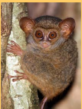
Tarsier.

We've all heard about their wonders. Tropical rainforests are home to the richest terrestrial biodiversity on earth, overflowing with vibrant and colorful life of every kind. Dense green jungles of lush ferns, delicate orchids, and twisting vines. Huge trees with buttressed roots and a canopy so high and complex it's a world unto itself. And thronging every leaf and vale, a spectacular array of birds and beasts: creepers, fliers, climbers, leapers and stalkers of all manner and hue. In Tompotika, about half of these creatures are found nowhere else in the world outside of Sulawesi: noisy troops of Sulawesi macaques; strange curly-tusked babirusa deer-pigs; huge, stately hornbills; mysterious marsupial cuscuses; tiny big-eyed tarsiers; and the marvelous maleo bird whose nearby beachside nesting habitat ALTO has been helping to protect since 2006.