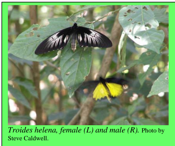
Troides helena, female (L) and male (R).

Do you like to travel, but also want to make a positive difference in the places you visit? Do you enjoy watching wildlife and contributing to scientific knowledge? Like to hike in tropical rainforest, snorkel the world's richest coral reefs, and spend time with local villagers? AITo's 2009 Ecotravelers will have an opportunity to do all these things plus join one of Indonesia's foremost lepidopterists, Dr. Djunijanti Peggie, in the first-ever butterfly survey of the Tompotika area. Sulawesi is home to over 500 butterfly species, many of them noted for their giant size and unique characteristics, and we will spend time with Dr. Peggie capturing and identifying those that occur in Tompotika. Ecotour dates are July 18 – Aug 2, 2009, and group size is limited to 10 people. Cost for the 16-day tour is $2950. Contact AITo or see our website for details.