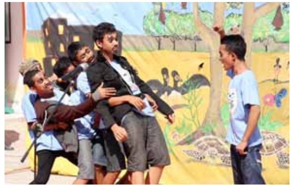
The young hero (right) confronts the wicked boss man (center) and his bumbling henchmen, explaining that poaching is illegal and they must cease.

much thought to endangered wildlife, and if