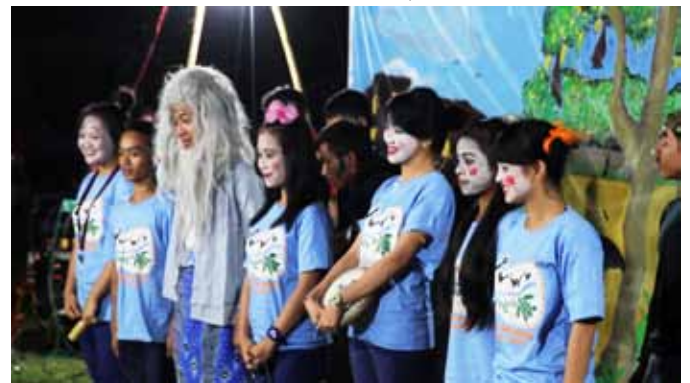
The 12 students were selected from all over the Tompotika region. Performing for strangers and for their neighbors was "great and sometimes embarrassing--but now I've really got courage," one said.

much thought to endangered wildlife, and if