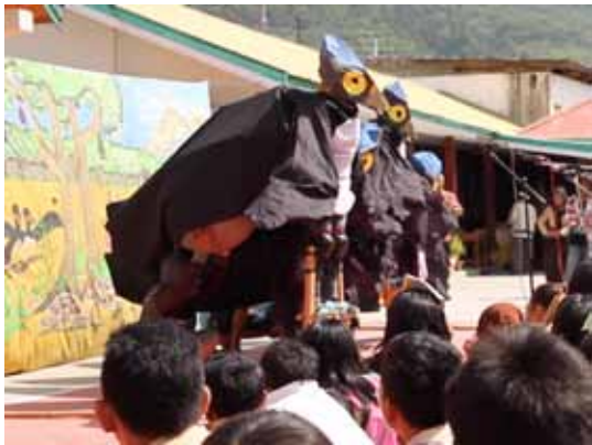
True to life, each female maleo in the show laid an enormous, precious "egg." Audiences cheered when, after being protected instead of consumed, the egg produced: yes--an adorable chick!

By the time of the first village performance, the students were ready, if a bit nervous. Once they got started, however, "the kids really came into their own as they went on the road," Nick said. Full of color and lots of humor, the show traces an arc from an early time when wildlife were plentiful and