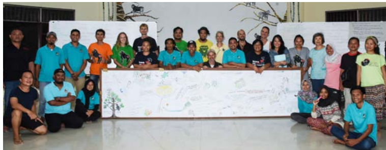
"Conservation may be swimming upstream, but it is a noble calling." 30 staff from 4 NGOs gathered to help each other grow in commitment and discipline.