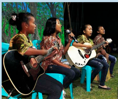
Let's All -- first place, Balantak Jackoustik contest. This band of four middle school girls chose for their name the English "Let's All" and then explained it by adding, in Indonesian, "... guard, protect, and preserve Sulawesi nature!"

cash and musical instruments. Open to all, a total of 12 groups performed, and the Camat (governor) of each district took part in judging.