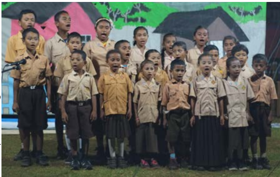
Top: Not just for kids! A group of ladies gets competitive with the maleo ring toss. "Where's my sticker?"