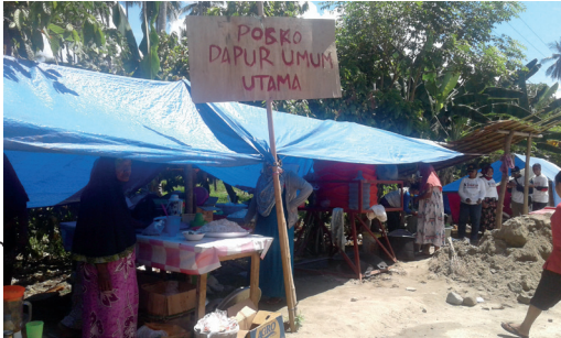
The team set up a public kitchen, serving food and also providing staples and equipment so folks could do their own cooking.