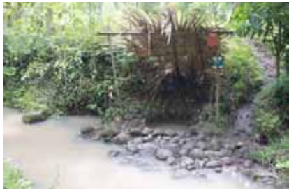
This highly-contaminated well is the primary water source for some Taima residents.

Hafiz's findings lay the groundwork for an ambitious new project: working together with villagers, AlTo aims to facilitate improved access to clean fresh water for all