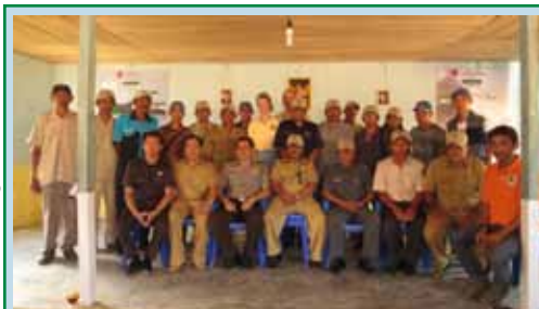
March 2013: Two dozen Tompotika village heads, police, and other high-ranking officials gathered in Teku village to address the problem of wildlife crime. As one official said, "The time has come to act."

Tompotika's stories are stories of hope. Perhaps these stories will help bring inspiration to others to save other important spots. Perhaps we'll all learn to live differently on Earth. And meanwhile, we will keep working, and keep generating more stories. Perhaps the stories can save us.