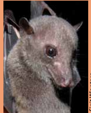
Sulawesi's fruit bats, like this endemic Rousettus celebensis , keep Tompotika's forests healthy.