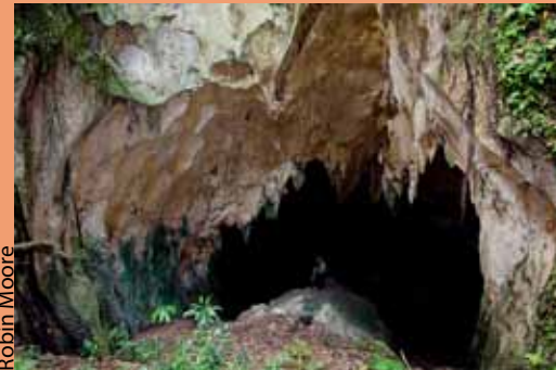
This Tompotika cave hosts tens of thousands of bats of more than 9 species.