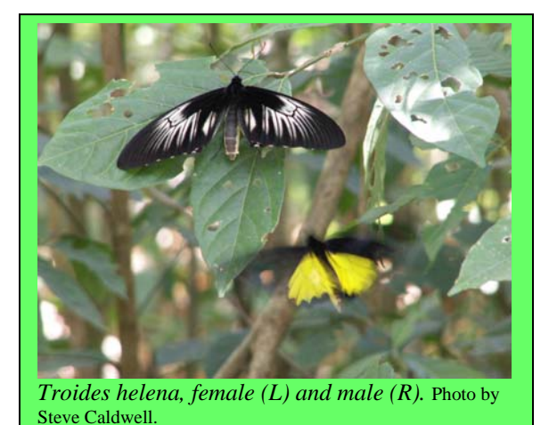
Summer 2009: Tompotika Ecotour and Butterfly Survey

Do you like to travel, but also want to make a positive difference in the places you visit? Do you enjoy watching wildlife and contributing to scientific knowledge? Like to hike in tropical rainforest, snorkel the world's richest coral reefs, and spend time with local villagers? AlTo's 2009 Ecotravelers will have an opportunity to do all these things plus join one of Indonesia's foremost lepidopterists, Dr. Djunijanti Peggie, in the first-ever butterfly survey of the Tompotika area. Sulawesi is home to over 500 butterfly species, many of them noted for their giant size and unique