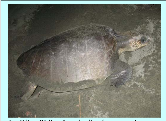
An Olive Ridley female digs her nest pit on Teku beach.

and Taima, virtually every detected sea turtle adult and nest was poached. Now, however, not only are turtles and nests being protected, but in their nightly beach patrols AlTo staff have discovered an additional sea turtle species not previously known to nest in the area: the Olive Ridley turtle ( Lepidochelys olivacea ). The Olive Ridley, along with Green, Hawksbill, and Leatherback turtles, makes Tompotika one of only a handful of places in the world in which four of the world's seven sea turtle species are documented to nest . AlTo is now gearing up for the 2009 sea turtle season (roughly March-August), in which we hope to expand our sea turtle patrols and initiate several new protection strategies.