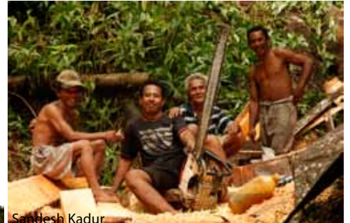
Sandesh Kadur Loggers in eastern Tompotika-likely without permits