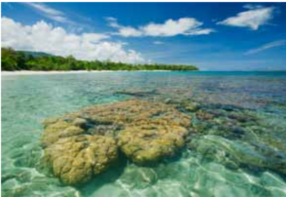
Corals and beach, Taima, Tompotika

Off in its remote corner of eastern Sulawesi, Tompotika is a place that simply begs a closer look. In the past few years, ALTO has helped sponsor a herpetological survey, a small mammal survey, and Tompotika's first-ever butterfly survey, yielding valuable scientific information and even discovering new species previously unknown to science--all to help increase our knowledge and appreciation of Tompotika's natural treasures.