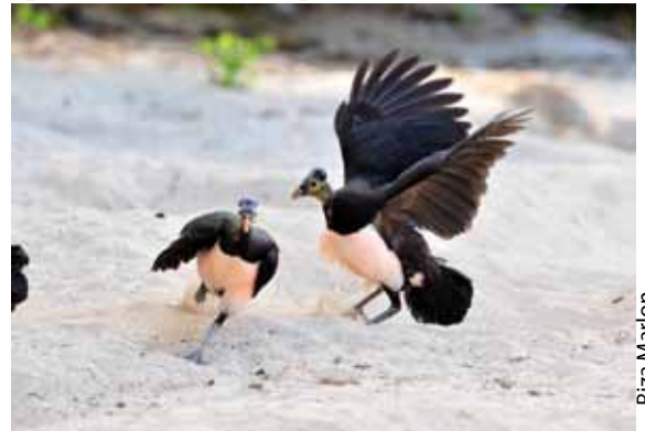
Maleo birds at Taima nesting ground

ALTO will use the resulting photos to create new outreach materials--posters, presentations, educational materials, etc. which will be used both within Indonesia--inviting locals to see their home in new ways-- and around the world. As this newsletter attests, good ( continued on p. 2 )