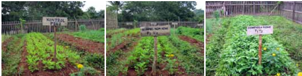
The effect of compost. Peanut plants of the same age grown with: Left - no compost; Center - compost made with local materials but no manure; Right - compost plus animal manure.

Everybody was happy. And then there was more! Village head Suharto Mangantjo announced that, in thanks for this most beneficial training, he was recommending that additional protected acreage be added to AITo's Tompotika Forest Preserve project (see article p. 2). That's what we call win-win-win!