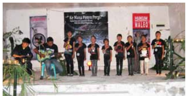
Schoolchildren perform a song and dance routine to support maleo and sea turtle conservation at the Balantak event.