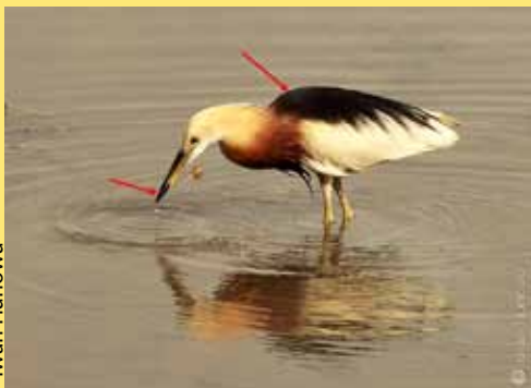
Ardea speciosa , the Javan Pond Heron, or Blekok Sawa. The new field guide will use arrows to highlight key identification characteristics, as pioneered in the Peterson field guide series.

This will not do! If we want people to know and treasure their natural heritage, they have to be able to find out what's there. Especially given that in Sulawesi, about 27% of the birds are found nowhere else in the world! So, ALTo has just begun a new effort to produce a simple, user-friendly field guide to the birds of Tompotika, aimed at both local Tompotikans and visitors to the area. The guide will contain photos, descriptions, and identification tips for all species known (continued on next page)