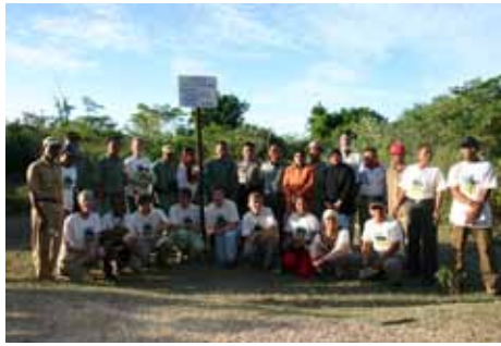
August 1, 2006: the newly-formed alliance places a new "protected" sign at the maleo nesting ground entrance.

guards than they had by selling eggs. Government officials were pleased to see the iconic maleo, which is protected under Indonesian law, receiving practical conservation attention. The students were delighted to be trained and hired as conservation professionals in AITo's new permanent staff. And all were deeply encouraged to see the maleo appearing to recover. Chicks began to hatch. Juvenile birds were spotted for the first time. Adult numbers increased.