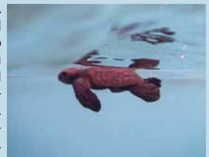
A newly-hatched Olive Ridley heads out towards the open ocean. If it can escape predators, this tiny hatchling will live for years among rafts of floating Sargassum seaweed. Upon reaching adulthood, females will return to the same Tompotika beaches where they were hatched.