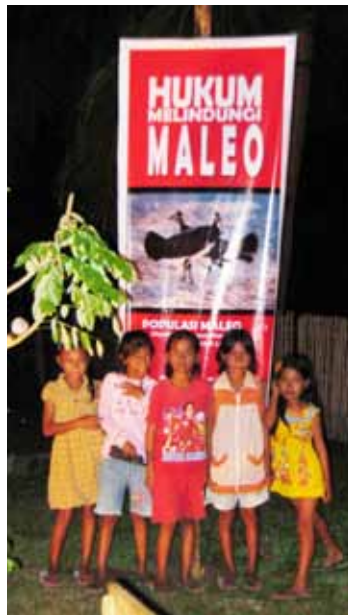
A group of girls pose at the Taima event. This banner translates: Law Protects the Maleo; another banner reads in English: "Not for Sale"

That's why ALTo has just launched a new program which pairs intensive education and outreach for law enforcement personnel with a stepped-up public awareness campaign about the protected status of maleos and sea turtles, who serve as flagships for other endangered wildlife. The program, which will include a newly-created "pocket guide to wildlife law" and a series of workshops for police and other law enforcement personnel, kicked off with public events in two of the main Tompotika districts in which ALTo works. Designed and directed entirely by ALTo's local Tompotikan staff, the performances included a combination of music, theater, and speeches--all centered on the idea that protecting Sulawesi's endangered wildlife is a welcome--and serious--obligation for all (continued on next page)