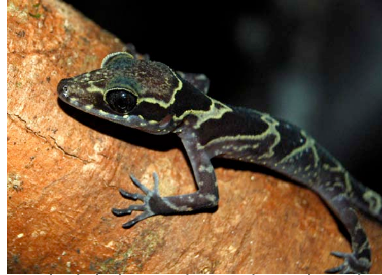
Cyrtodactylus batik , a new gecko species discovered on an AlTo survey in 2009 and known only from Tompotika.

Even though any field guide in Sulawesi is likely soon to become obsolete--this is the frontier!--we are keen to help create them. For our goal, at AITo, is to help people--people